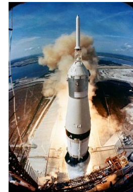
Apollo 11 – Neil Armstrong's rocket.