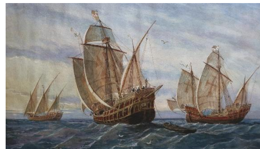
Christopher Columbus' ships – Nina, Pinta and Santa Maria.

Key vocabulary: Ocean – One of the five very large areas of sea on the Earth's surface. Explorer – someone who travels to places about which very little is known, in order to discover what is there. Sailor – a person who works on a ship or sails boats. Merchant – a person who buys and sells goods. Voyage – a long journey on a ship or in a spacecraft Astronaut – an officer in charge of a flight Flight commander – a person in charge of a flight Descend – move downwards Gravity – the force which causes things to drop to the ground