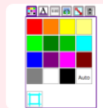
The 2Calculate toolbox