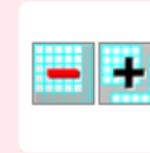
Increase or decrease spreadsheet size