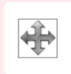
Move cell tool