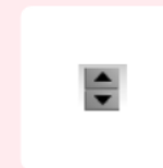
The 2Calculate control toolbox