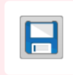
Save your work