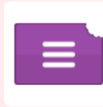
Open, close or share a file